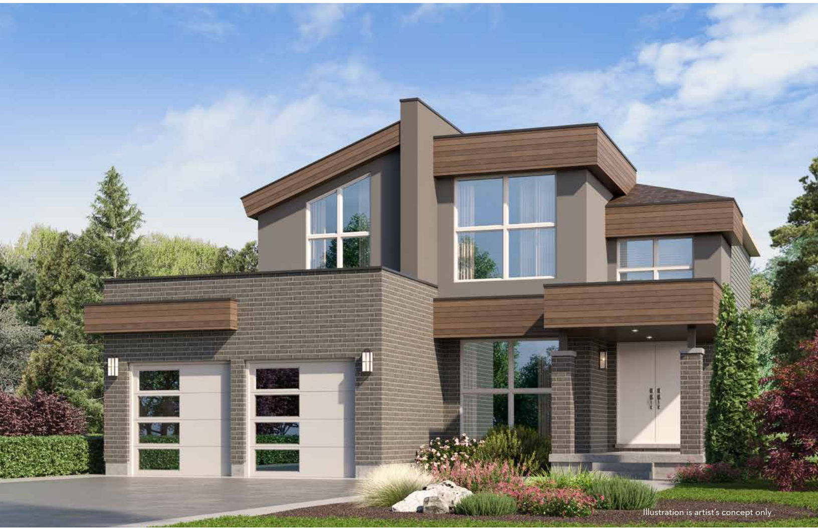
Illustration is artist's concept only