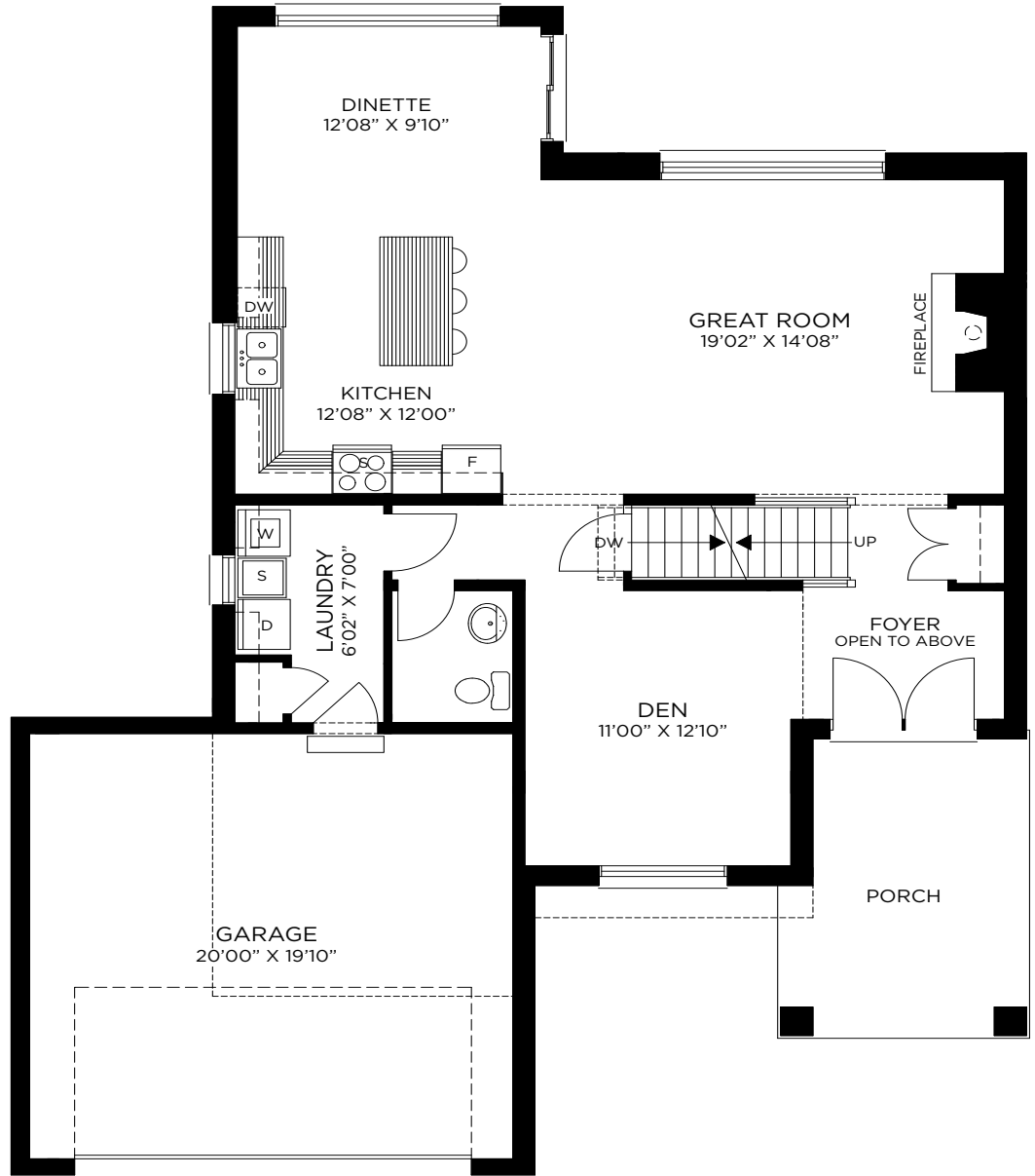
FIRST FLOOR PLAN (STANDARD)

All items are as per Vendors' standard samples and specification. E. & O.E.